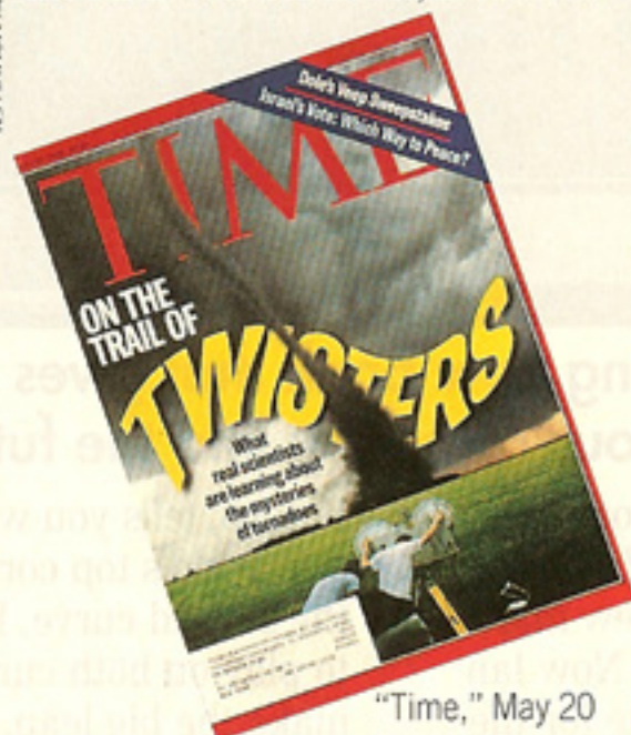
"Time," May 20 Free ad?

THE May 20 cover of Time magazine was a seven-page "science" story headlined On the Trail of Twisters: What Real Scientists Are Learning About the Mysteries of Tornadoes , complete with a sidebar review of the new movie Twister . The flick also showed up on Entertainment Weekly's May 17 cover. Who produced the film? Warner Bros., as in Time