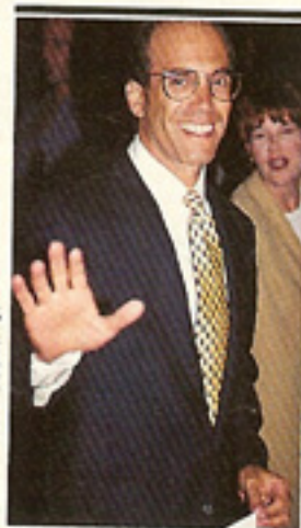
Press hound Jeffrey Katzenberg Not a details guy.

JEFFREY KATZENBERG announced with great fanfare his lawsuit against the Walt Disney Co. for the $250 million he says Disney owes him. There was just one problem: Katz-