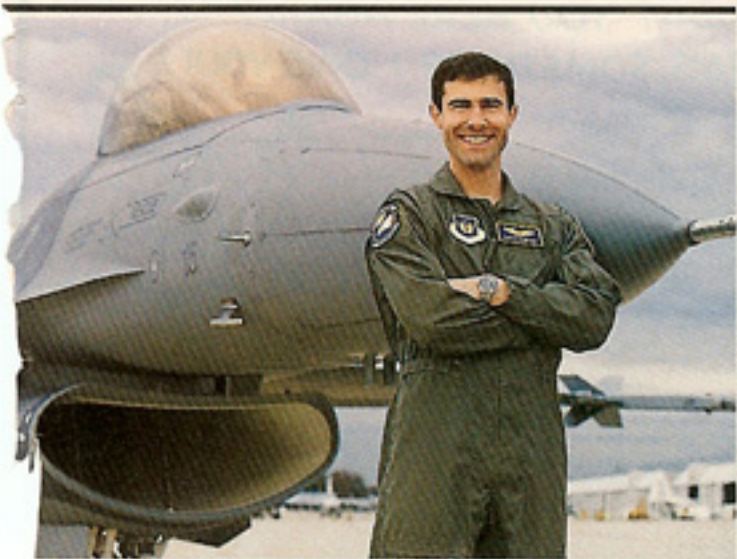
American hero Scott O'Grady Hollywood's dose of reality.

In the meantime, Adair, always the entrepreneur, has introduced his own line of memorabilia. A set of four 9-ounce "True American" Red Adair tumblers (adorned with the American eagle) will set you back $42.50; a signature Red Adair belt buckle, $19.95. An autographed photo of Adair, the "fearless man who fought the most terrifying forces in nature and won," is $12.95.