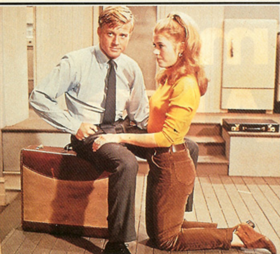
Robert Redford and Jane Fonda in the 1967 film "Barefoot in the Park" Says Redford: "I don't have Jane . . . but I did."