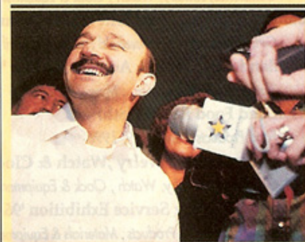
Former Mexican president Carlos Salinas Where are you, Carlos?

SINCE BEING NAMED to the board of directors of Dow Jones last year, Mexican ex-president Carlos Salinas has missed three of the last five board meetings. Can it be that Salinas is staying away to avoid facing the horde of Mexican reporters who besiege the Dow Jones offices on the date of each meeting?