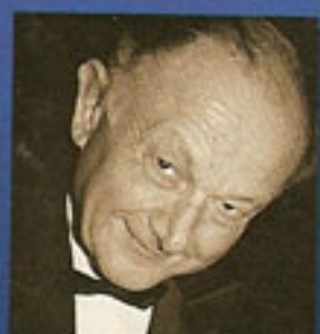
Ted Arison Israel